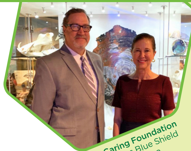
The Caring Foundation Blue Cross Blue Shield of Alabama