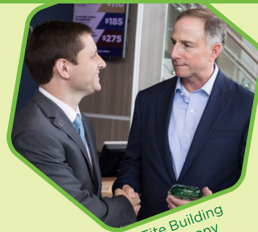
Fite Building Company