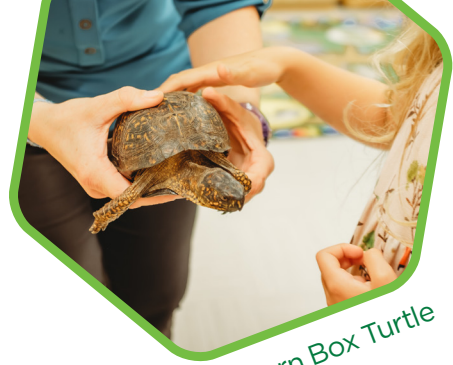
Eastern Box Turtle