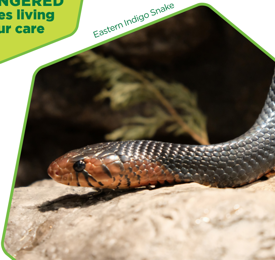
Eastern Indigo Snake