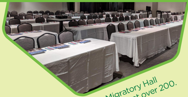
Migratory Hall can seat over 200.