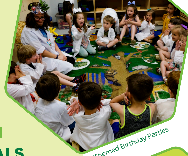
Themed Birthday Parties