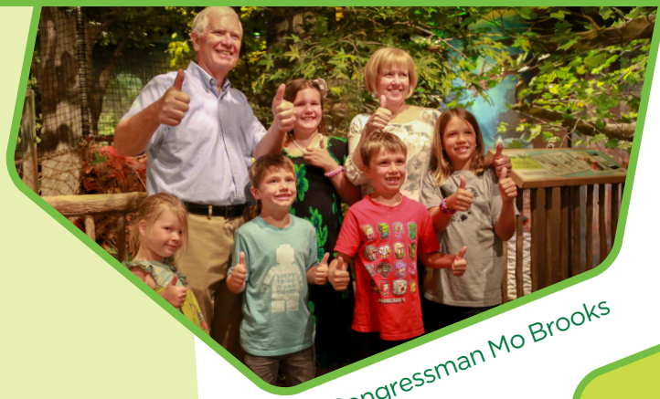
Congressman Mo Brooks