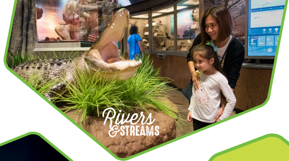
Rivers & STREAMS

77,000+ MUSEUM VISITORS JUNE-DECEMBER OF 2019