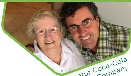
Decatur Coca-Cola Bottling Company