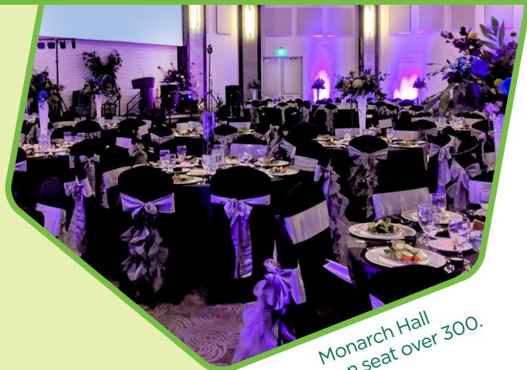
Monarch Hall can seat over 300.