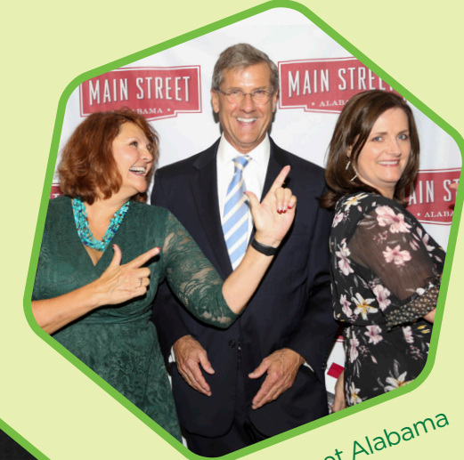
Main Street Alabama